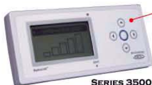
SERIES 3500 HYDROLINK™ REMOTE